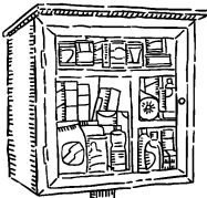
Free Little Pantry

The Little Free Pantry is now available to provide nonperishable food and other necessities in the Mt. Horeb area. The two outdoor pantries are available 24 hours a day and can be found at