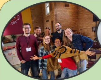
Young Adults in Global Mission

A Monthly Newsletter of Evangelical Lutheran Church of Mount Horeb