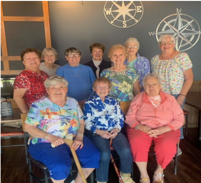
Rebecca Circle was formed 51 years ago in 1973