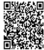
Early Release Childcare

YOUTH BAKING CINNAMON ROLLS - Middle and High school youth are welcome to join us on March 8th, 1 pm - 4 pm to make delicious cinnamon rolls, that will be frozen and then baked fresh for our Easter Breakfast in April.